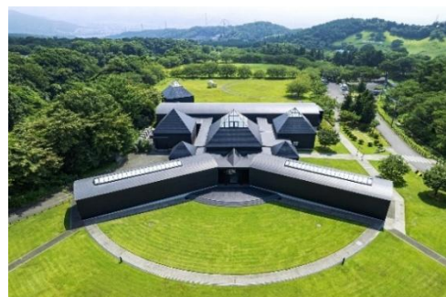
Exterior view of Hara Museum ARC