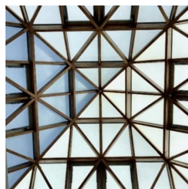
Skylight in Gallery A at Hara Museum ARC

Since the days of its predecessor, the Hara Museum of Contemporary Art