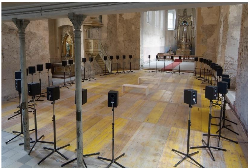
[1] Johanniterkirche, Feldkirch, Austria, 2005

Gallery A at Hara Museum ARC, designed by Arata Isozaki, is a space illuminated by natural light pouring in through a 12-meter-high skylight supported by four cedar pillars, the intensity modulated by the passing clouds. Although the gallery embodies the characteristics of a white cube for contemporary art works, the feel of nature is visceral within a space that was designed as an expression of “ ma ,” the spatial and temporal concepts that form the essence of Japanese aesthetics. In this space, we present Janet Cardiff's sound installation The Forty Part Motet .