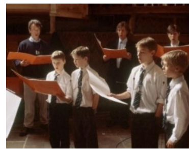
[4] Recording Session, Salisbury Cathedral New York. Choir 2000