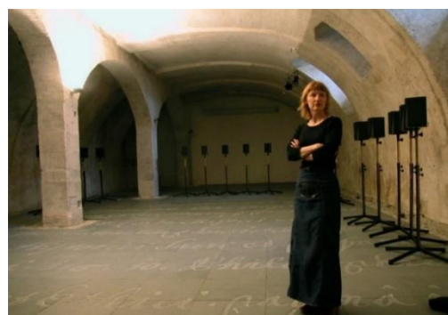
[5] Kunstmuseum des Kantons Thurgau, Switzerland with Artist 2002