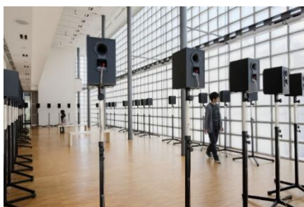
[3] Fondation d'entreprise Hermès, Tokyo, 2009