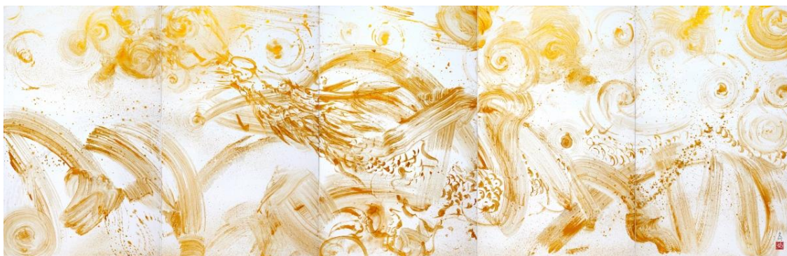
love & love -Mother Earth- , 2022 gold paint, gold powder and acrylic on canvas 116.7 x 363.5 cm

Venue: Café d'Art and The Museum Shop at Hara Museum ARC