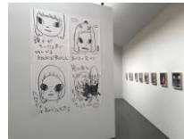
View of Part II in Gallery B.

*Details about this event will be announced on the Hara Museum ARC website.