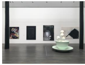
View of Part II in Gallery A.

Hara Museum ARC is currently holding Part II (autumn/winter) of the exhibition Opposite the Sun Is Where the Blue Sky Lies . This exhibition introduces contemporary artworks from the museum's collection amassed over the span of more than 40 years, by artists such as Shigeko Kubota who pushed the