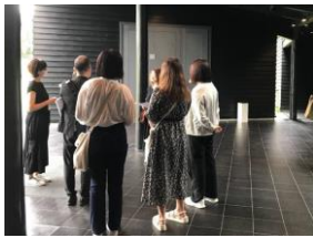
View of guided tour in progress.

Venue: Hara Museum ARC Contemporary Art Galleries A, B, C and the Kankai Pavilion