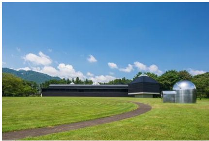
Exterior view of Hara Museum ARC and Olafur Eliasson, Sunspace for Shibukawa , 2009

*Continues in event of rain (cancelled in case of severe weather)