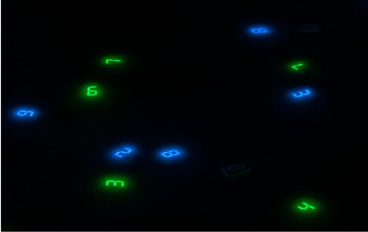
Tatsuo Miyajima, Demonstration of the Sea of Time - TOHOKU Project (reference image)

Using digital counters with digits that represent the eternal nature of life, Tatsuo Miyajima has continued to make art that express his thoughts about life and death based on the core concepts of "Keep Changing, Connect with Everything, Continue Forever." As part of his Sea of Time - TOHOKU Project , Miyajima is holding "time setting" workshops for people to share feelings and memories about the Great East Japan Earthquake that occurred on March 11, 2011. By the time he completes the project, he will have involved 3,000 people in the project. In this special exhibit, the artist will be displaying a portion of the digital counters produced for the project to date.