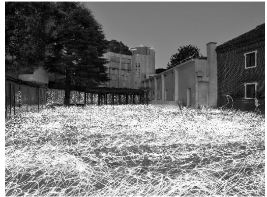
[5] Tokihiro Sato, Photo-Respiration Harabi#1 , 2020 pigment print ©Tokihiro Sato

Sato was born in 1957 in Yamagata. Since the 1980s, he has focused mainly on the themes of light, time, space, the human body and life. Sato is known for his Photo-Respiration series of photographs made using long exposures by which presence and movement within a landscape are indicated solely by points of light from a handheld penlight or mirror. Also included are new breath-graphs made with a digital camera at the Hara Museum which is scheduled to close at the end of this exhibition, and at Hara Museum ARC which will continue as the sole venue.