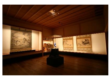
[4] Installation view of Kankai Pavilion

The Kankai Pavilion was built in 2008 as part of an expansion of Hara Museum's annex, Hara Museum ARC that took place to mark the 20th anniversary of its founding in 1988. Its purpose is to provide a showcase for the Hara Rokuro Collection of traditional East Asian art. At present, about 120 works comprise the collection, including a number of works designated National Treasure or Important Cultural Property.