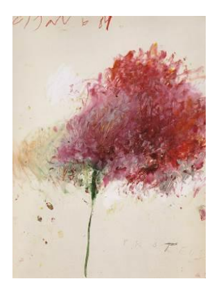
D <Example of his work during the '80s and '90s>