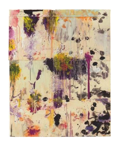
F < Example of his work during his last years during the '00s>