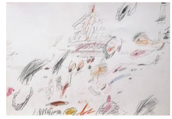
B < Example of his work during the '60s and '70s>