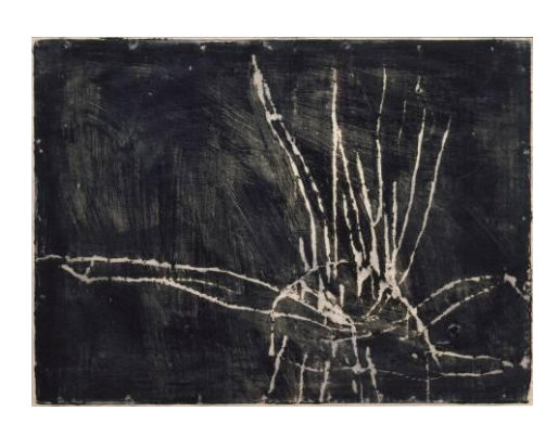
A < Example of his early work during the '50s>

*Please include the related credit for each image used. Images should not be trimmed, altered or superimposed with text.