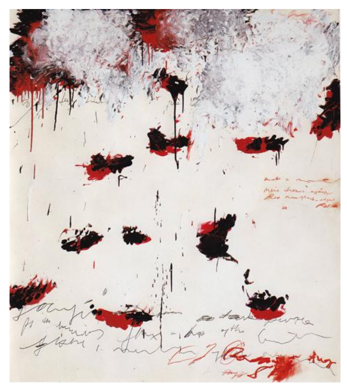
Petals of Fire, 1989 144 x 128 cm acrylic paint, oil stick, pencil, color pencil on paper

The Hara Museum of Contemporary Art is proud to present the first major solo exhibition in Japan by Cy Twombly, one of the titans of twentieth-century art. Featuring some 70 drawings, paintings and monotypes<sup>1</sup> done on paper from 1953 to 2002, this retrospective spans 50 years of Twombly's extraordinary career. It was first held in 2003 at the State Hermitage Museum in St. Petersburg<sup>2</sup>, organized by Julie Sylvester, the Hermitage's first non-Russian curator with Cy Twombly himself taking part in the selection of the artwork. Although the artist sadly passed away in 2011, the present show was made possible by the cooperation of the Cy Twombly Foundation which participated in all aspects of its planning. Although Twombly is represented in a number of museum collections in Japan <sup>3</sup> and has been featured in several group shows<sup>4</sup>, the relatively few opportunities to see Twombly's art in Japan make this present show a long anticipated event by Japanese audiences.