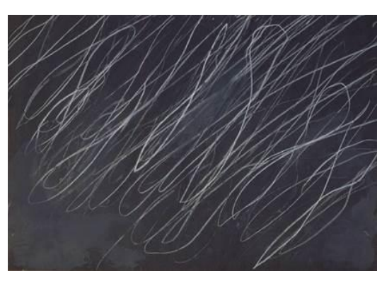
C <Example of his work during the '60s and '70s>