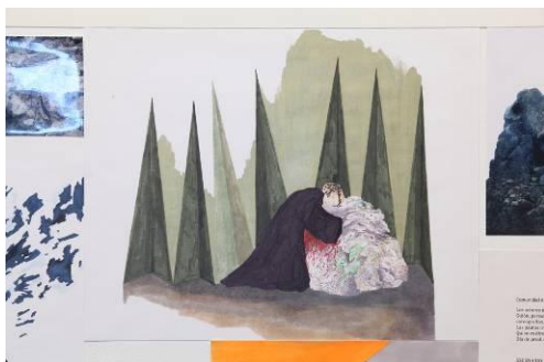
Florencia Rodriguez Giles Fictional Islands 2009 pencil, marker-pen, watercolor, paper, photograph prints 100 x 100 cm (Installation size) (partial view)