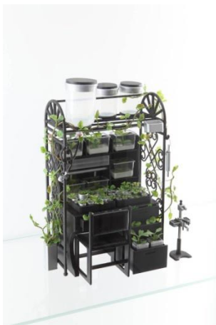
Donna Ong In the Secret, in the Quiet Place (iv) 2008 enamel, plastic, plastic toys 20 x 13 x 27 cm Private collection