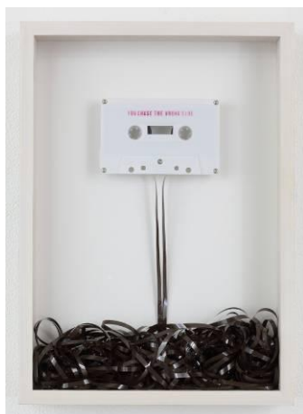
Duto Hardono Untitled (You Chose the Wrong Side) 2011 framed hand stamped cassette tape 36.0 x 21.2 cm