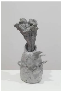
Erika Verzutti Carbonada 2010 concrete, glass beads 32 x 13 x 13 cm