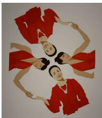
Mary Elizabeth Yarbrough Oh-me nee kakatte ureh-shee des! (I am glad that I meet you!) 2007 duct tape and contact paper on contact paper 63 x 55 cm