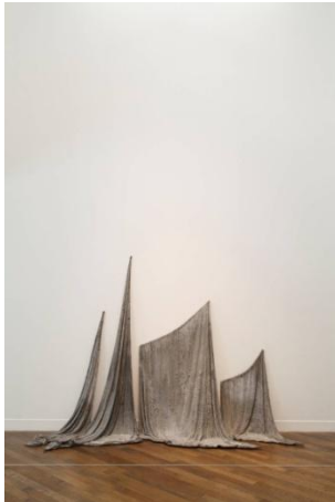
Thiago Rocha Pitta Monument to the Continental Drift 2012 cloth, cement , etc 260 x 58 x 177 cm