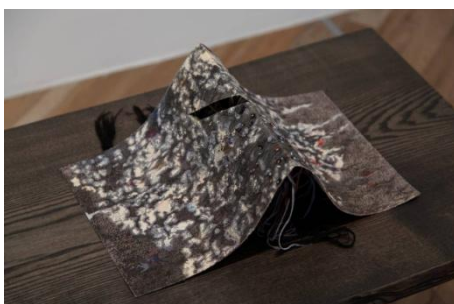
Minam Apang Hillside Stories: A Dog Brings the Shadow, Remembering Hachiko 2008 cotton thread, glue, paper, wooden pedestal 26 x 56 x 15 cm (object); 52 x 90 x 40 cm (pedestal) Private collection