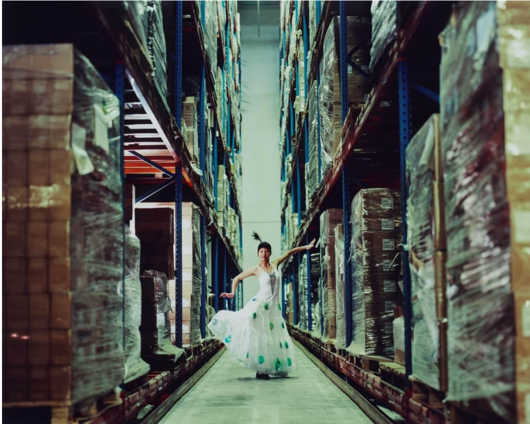
[1] Cao Fei, My Future is Not a Dream No. 2 , 2006 120 x 150 cm C-print © Cao Fei / Deutsche Bank Collection

September 12 (Saturday), 2015 – January 11 (Monday, national holiday), 2016