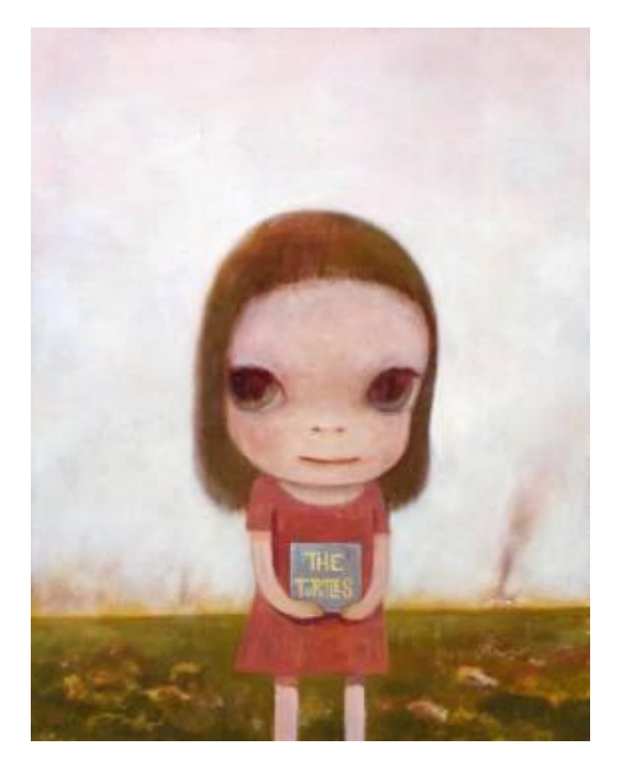
[1] Yoshitomo Nara, Eve of Destruction , 2006, acrylic on canvas

Dates: January 14 (Fri.) – June 12 (Sun.), 2011 *the exhibition period has been extended.