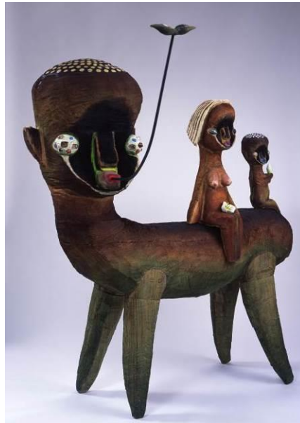
[1] Izumi Kato, Untitled , 2008 wood, acrylic paint, oil, stone 185 x 167 x 110 cm

May 28 (Saturday) – August 21 (Sunday), 2016