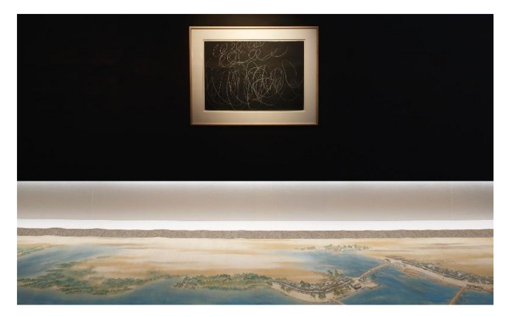
Installation view at the Kankai Pavilion Photo by Keizo Kioku Cy Twombly, Untitled , 1970 © Cy Twombly Foundation / Courtesy Cy Twombly Foundation Landscupe of Yodo River , Maruyama Okyo, Edo period

May 29 (Friday) – September 2 (Wednesday), 2015 Kankai Pavilion at Hara Museum ARC