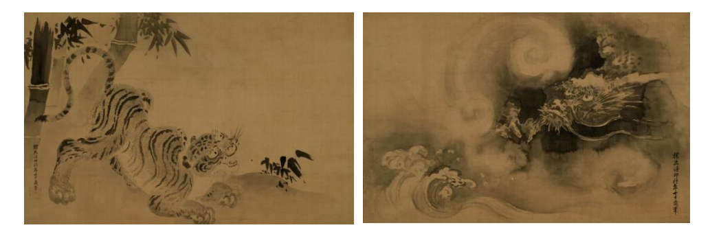
4, 5. Dragon and tiger, Kano Tan'yu, pair of hanging scrolls, ink on silk, Edo period