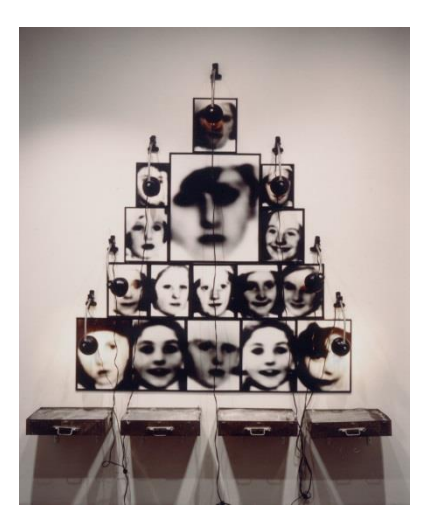
2. Christian Boltanski, Fête de Pourim , 1990© Christian Boltanski