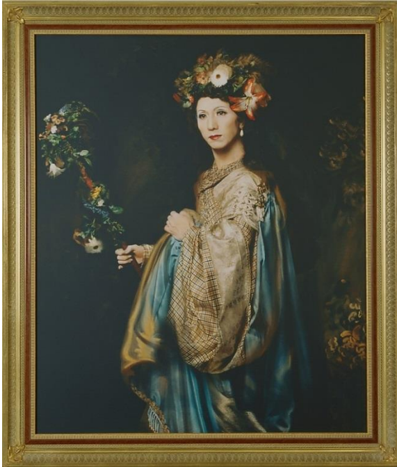
Yasumasa Morimura, Portrait of the Family – Wife, 1994

Rembrandt painted many portraits of his wife Saskia as Flora, the goddess of spring, treating the world of myth as something familiar. Through the act of "entering" into these famous paintings by the past master, Yasumasa Morimura sought to draw closer to Rembrandt the man and the history of art. Flora is a goddess of both fertility and flowers.