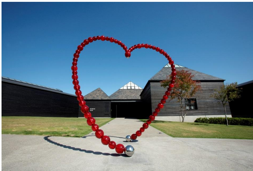
Jean-Michel Othoniel, Kokoro , 2009

The parallel show at the Hara Museum of Contemporary Art, entitled The Hara Museum Collection at 35 (October 25, 2014 - January 12, 2015), showcases artists who have been active in Japan, including Lee Ufan and other members of the Mono-ha school, as well as other artists of the same era.