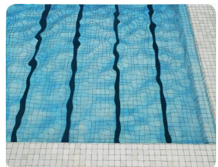
Adriana Varejao, Swimming Pool , 2005