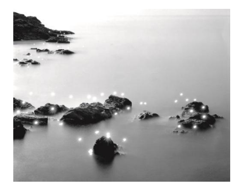
3. Tokihiro Sato, #333 Yura, 1998