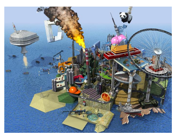
1. Cao Fei, RMB City: A Second Life City Planning, 2009

Time Visualized – Selections from the Hara Museum Collection October 17 (Saturday), 2015 – January 11 (Monday, national holiday), 2016 Galleries A, B and C (Contemporary Art)