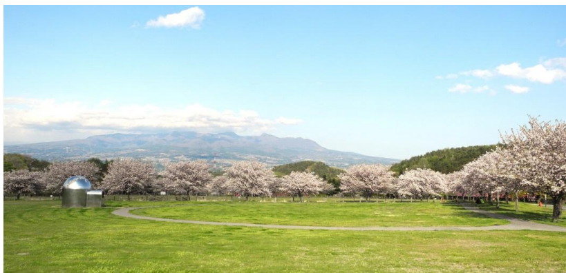
View of Mt. Akagi from corridor.