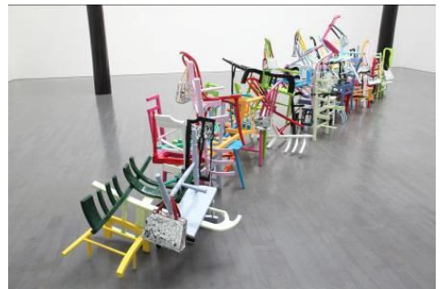
From the left: Yayoi Kusama, Mirror Room, 1991 / Tadanori Yokoo, Who Shall Forget about Homeland?, 2001 / Jim Lambie, Train in Vain, 2008

The following events will be held during this period: Exhibition: Seeing the Sound, Hearing the Picture