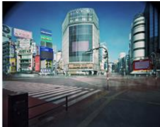
[1] Tokihiro Sato, An hour exposure 1990/2017 Tokyo – Shibuya , 2017 photograph/diptich