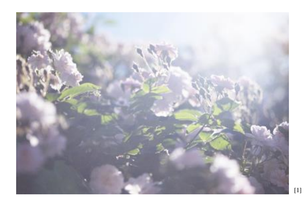
When I woke up in the morning, the sky was incredibly blue and beautiful. I thought it would be a nice day to depart if we all had to. (Mika Ninagawa, excerpt from The days were beautiful: translation by Futaba Fujikawa)

One might imagine the existence of landscapes that are perceivable only to people facing death their own or that of someone truly dear to them. People with such a sensitivity may look and suddenly see life glowing in the blue of the sky, in the budding leaves, in the scent of the wind, despite the constant sorrow and unease within them. Such was the sensitivity that lay behind the photographs that comprise The days were beautiful .