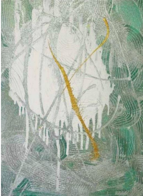
1. Kengo Kito, cartwheel galaxy , 2017 (part) © Kengo Kito

Kankai Pavilion (Traditional East Asian Art)