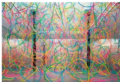
3. The installation view of Multiple Star I