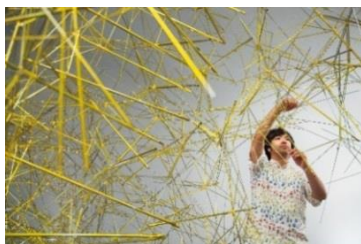
5.

1977 Born in Nagoya, Aichi, Japan 2001 Graduated from the department of oil painting at Nagoya University of Arts. 2003 Completed postgraduate studies at Kyoto City University of Arts. 2008-09 Resided in New York (USA) as a recipient of a Gotoh Foundation Scholarship. 2010-12 Resided in Berlin (Germany) for two years under the Overseas Study Program for Upcoming Artists of the Japanese Agency for Cultural Affairs.