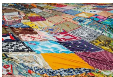
2. Multiple Star III (detail/reference image)

For the artist, who recently marked his 40th birthday, Part III represents a culmination of his creative activities to date in the form of a new large-scale installation. Made specifically for the venue, the installation follows Kito's past creations in the way they changed appearance depending on the light or movement of the viewer. This aspect was manifested in such pieces as a rotating disk (Image 1) comprised of numerous discrete mirrors that produced an ever-changing pattern from the reflected image or scene, or numerous scarves (Image 2) stitched together, each with a totally different pattern. In the new installation, elements from previous explorations interact in complex ways to form a single work of art. Kito's ambitious use of space is sure to surprise and delight.