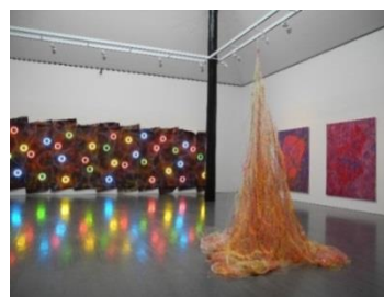
4. The installation view of Multiple Star II