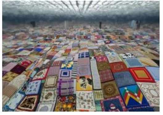
inconsistent surface, 2011

Hara Museum ARC is delighted to present Kengo Kito: Multiple Star , a 10-month long exhibition that will run for the duration of the year. The exhibition will be divided into three seasonal parts and featuring a completely different large-scale installation created on-site by the artist as its centerpiece.