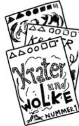
Crater and cloud, 1982-90