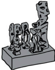
Monument for the divided Germany, 1986