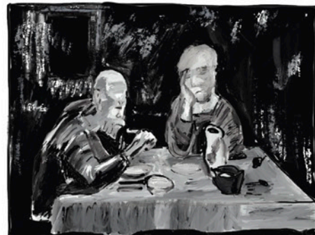
Man and woman at a table, 1959

SHOWS INFLUENCE FROM VAN GOGH'S "POTATO EATERS."