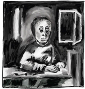
Woman near window at night, 1957