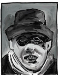
Self-portrait with hat, 1958

IN THE LATE 1950S, HE MADE PAINTINGS IN THE STYLE OF PICASSO AND REMBRANDT. IN EAST GERMANY, PICASSO WAS CONSIDERED A DUBIOUS ARTIST.