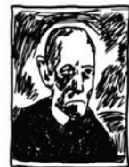
PORTRAIT OF HIS GRANDFATHER

INCIDENTALLY, EAST GERMANY AT THE TIME FAVORED THE REALISTIC REPRESENTATION OF LABORERS AND OTHER THEMES IN A STYLE CALLED "SOCIALIST REALISM."