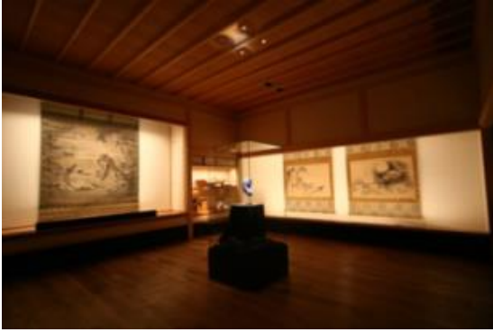
[2] Installation view at Kankai Pavilion ©2019 Izumi Kato

The Kankai Pavilion was built in 2008 as part of an expansion of Hara Museum ARC that took place to mark the 20th anniversary of its founding in 1988. The Pavilion's aim was to augment the ARC's original purpose as a museum of contemporary art by providing a unique showcase for the Hara Rokuro Collection* of traditional East Asian art. It was designed by Arata Isozaki, who also designed the ARC's other buildings. By incorporating features of the Japanese shoin (drawing room), it offers the viewer a new spatial experience that lies at the intersection between the traditional and the modern