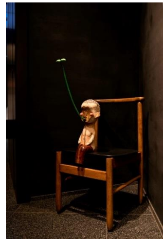
[3] Installation view at Kankai Pavilion ©2019 Izumi Kato

Directions: By train: Take the Joetsu/Hokuriku Shinkansen to Takasaki, change to the Joetsu/Agatsuma Line, and disembark at Shibukawa. From Shibukawa, ARC is 10 minutes away by taxi or 15 minutes by bus (take the Ikaho Onsen bus to "Green Bokujo Mae"). By car: 8 kilometers (about 15 minutes) from the Kan-etsu Expressway Shibukawa Ikaho Interchange (in the direction of Ikaho Onsen). Free parking is available (50 spaces).