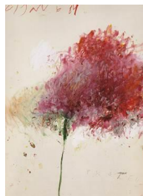
D <Example of his work during the '80s and '90s>