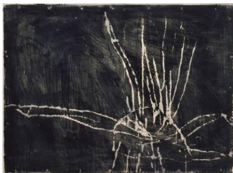
A <Example of his early work during the '50s>

*Please include the related credit for each image used. Images should not be trimmed, altered or superimposed with text.