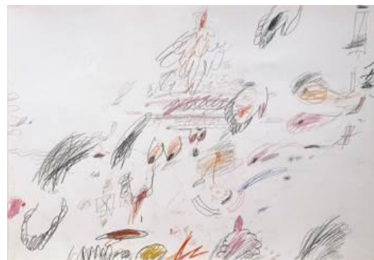
B <Example of his work during the '60s and '70s>