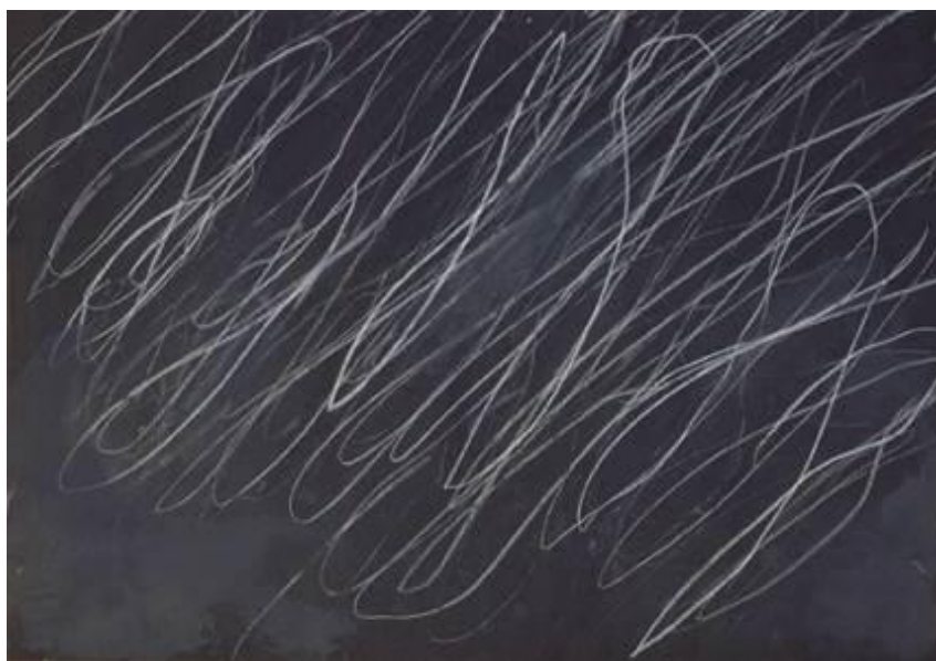
Untitled, 1970 70.5 x 100 cm wax crayon, house paint on paper

Cy Twombly (1928-2011) was one of the most widely admired artists of the 20th century. Both a prolific painter and sculptor, he developed a style of painting that may be best described as painted poetry. Born in the United States, he began dividing his time between the US and Italy from his late 20s. Over the next decades, he quietly cultivated his own unique niche within the art world, aloof from the major art trends. His fame, however, grew on both sides of the Atlantic and spread to the rest of the world, garnering him many honors and awards that included Japan's Praemium Imperiale in 1996, the Golden Lion Award at the Venice Biennale in 2001 and the Legion of Honor Chevalier Medal in 2010.