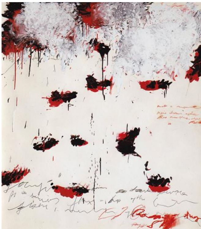
Petals of Fire , 1989 144 x 128 cm acrylic paint, oil stick, pencil, color pencil on paper

May 23 (Saturday) – August 30 (Sunday), 2015