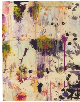
F <Example of his work during his last years during the '00s>