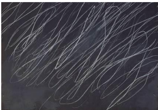
C <Example of his work during the '60s and '70s>