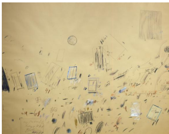
3. Bolsena, 1969 145.5 x 180.5 cm pencil, color pencil, felt pen on paper