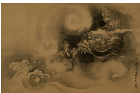
4, 5. Dragon and tiger , Kano Tan'yu, pair of hanging scrolls, ink on silk, Edo period