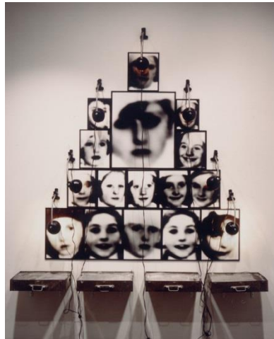
2. Christian Boltanski, Fête de Pourim, 1990 © Christian Boltanski