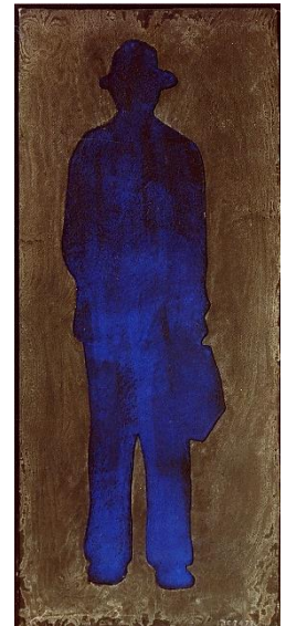
3. Jonathan Borofsky, Man with a Briefcase at No.3274726, 1990