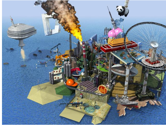
1. Cao Fei, RMB City: A Second Life City Planning , 2009

In music and movies, the passage of time is clearly expressed, but in art, time comes in many different forms. There is of course the time spent making the artwork and the time spent viewing it. Artists often try to capture "momentary time" in their artwork, or express "elapsed time" through some process or material that transforms, or "irreversible time" through some action or repetition.