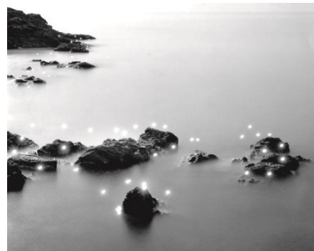
3. Tokihiro Sato, #333 Yura , 1998