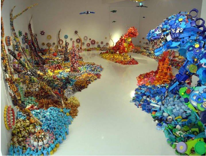
Hitoshi Fuji, Toys Paradise , 2010, 3331 Arts Chiyoda