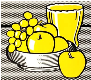
Roy Lichtenstein, Still Life with Scalloped Bowl 1972 ©Estate of Roy Lichtenstein, N.Y. & JASPAR, Tokyo, 2013 E0568

Pop Art first sprouted in England in the mid-1950s and came to full bloom in the United States during the '60s. True to its name, it was a universally accepted popular art movement that took the world by storm. Using simple forms, strong lines and pure colors and motifs such as everyday items and waste, advertising, comics, and celebrity photos, it symbolized a society of mass production and mass consumption while inviting us to consider universal themes such as the sacred and the profane, beauty and ugliness, illusion and reality, and life and death.