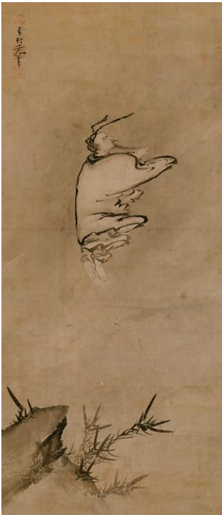
1. Portrait of Lie Zi , Sesson, hanging scroll, Muromachi period

Kankai Pavilion (Traditional East Asian Art)