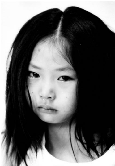
[2] Nobuyoshi Araki, from Naked Faces, 1984