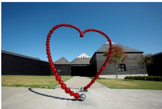
[4] Jean-Michel Othoniel, Kokoro , 2009

Hara Museum ARC opened in 1988 in Shibukawa, Gunma prefecture as an annex to the Hara Museum of Contemporary Art in Tokyo (see box on the last page). Situated in the foothills of the Mt. Haruna, one of the so-called Jomosanzan or "Three Peaks of Jomo" (the old name of Gunma), the museum's large-scale wooden buildings with their sleek black exteriors (designed by Arata Isozaki) stand in stark contrast to rich greens of the surrounding highland scenery. In addition to exhibitions centered on the museum's permanent collection, Hara Museum ARC holds events, workshops and various art education programs. In 2008, an Open-view Storage and Kankai Pavilion were added as part of