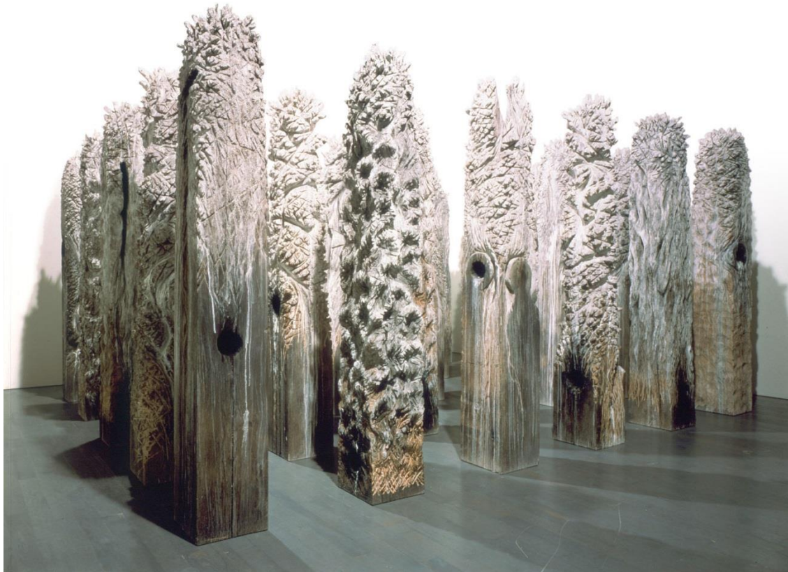
[1] Shigeo Toya, Woods II , 1989-90 ©Shigeo Toya Installation view at Hara Museum ARC

This exhibition looks back on three seminal traveling exhibitions organized by and held at the Hara Museum of Contemporary Art in Tokyo. These exhibitions, Primal Spirit – Ten Contemporary Japanese Sculptors (1990-1991), Photography and Beyond in Japan; Space, Time and Memory (1994-1997) and Shiro Kuramata 1934-1991 (1996-1999) were large-scale projects intended to introduce to the wider world cutting-edge expression by Japanese artists in the areas of sculpture, photography and design, respectively. By showing selected works from each of these projects, this exhibition seeks to shine a spotlight on the artworks themselves and their position and impact within the art world.